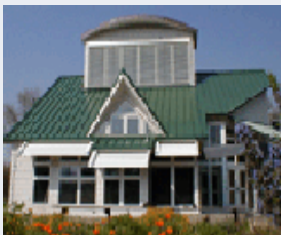
Environmental Technology Center (ETC) at Sonoma State University