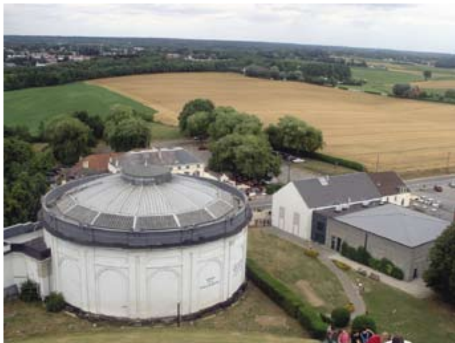
The Waterloo visitors' center, slated for demolition, stands next to a 1912 neoclassical building housing a 360-degree panoramic painting of the battle that will remain at the site.

On the plateaus of eastern Brazil, stone dwellings tell the story of a nineteenth-century diamond rush