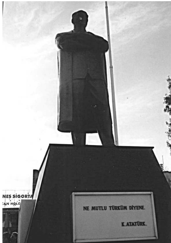
FIGURE 3 Monument to Kemal Atatürk