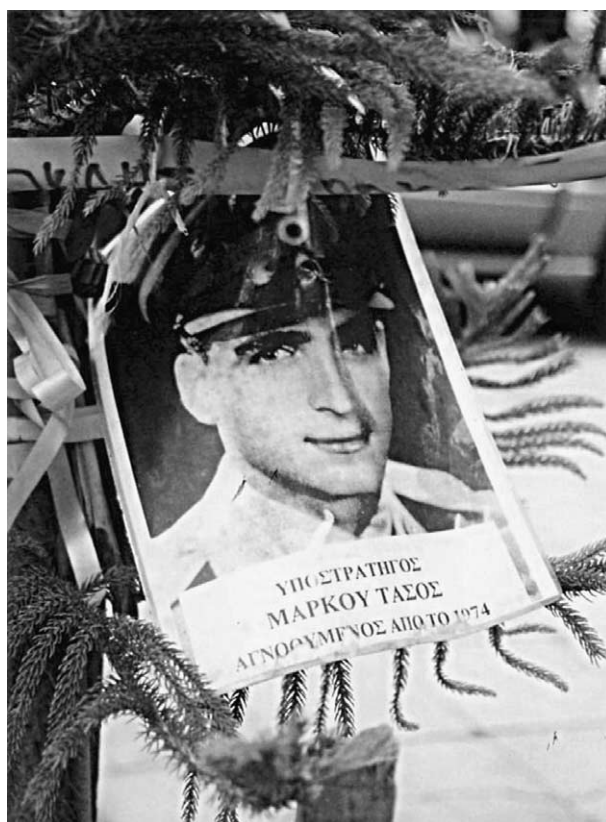
FIGURE 4 Memorial to Greek Cypriots who disappeared in 1974

and Freedom' that appeared in Tiananmen Square, Beijing, during the demonstrations of 1989, of which only images and reproductions now remain. 12 The Republican political murals in Northern Ireland are related to this genre. 13 A more ambiguous case (since it is tolerated by authorities and has been a site for church-sanctioned acts of memorial, for example) is the shrine-like memorial, to Jean Charles de Menezes at Stockwell tube (underground railway) station in London, near to the site where this Brazilian electrician was shot and killed on 22 July 2005 by the police (who later claimed to have mistaken him for a terrorist about to detonate a bomb). Fourthly, there are unauthorized individual monuments. These may relate to, but are not simply reducible to, the hegemonic ideology (as in Figure 1). Finally, there are also more anti-hegemonic 'individually' made monuments, which make some form of critique and which might often merge with graffiti.