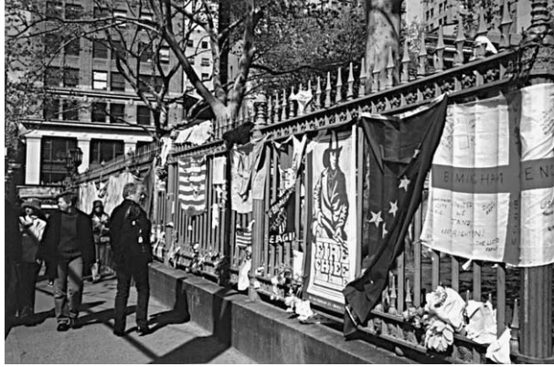
FIGURE 2 'Ground Zero' memorials