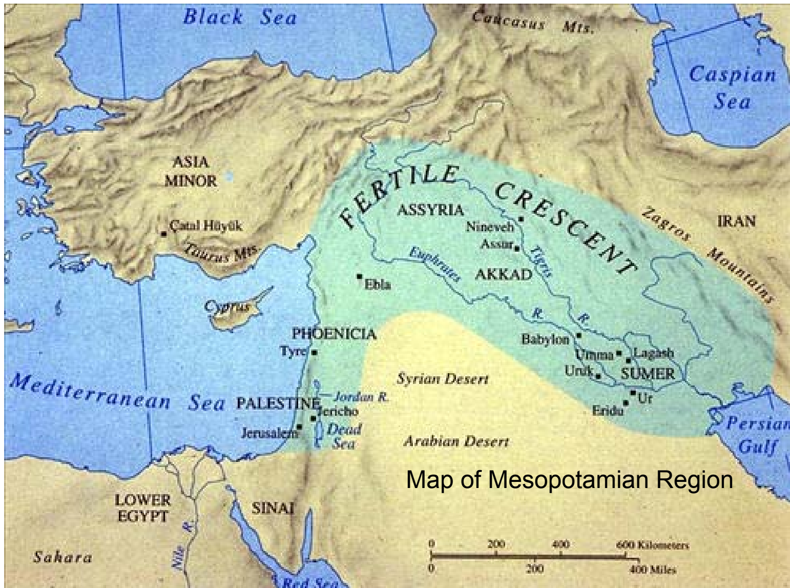
Map of Mesopotamian Region